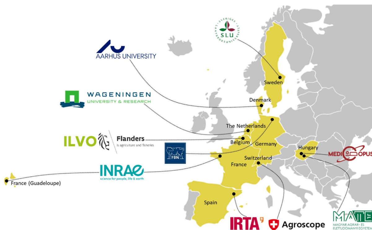
Figure 1 PIGWEB TNA consortium map. Ten research infrastructures (logos) in nine different countries (yellow) are offering TNA to 28 experimental pig research installations.